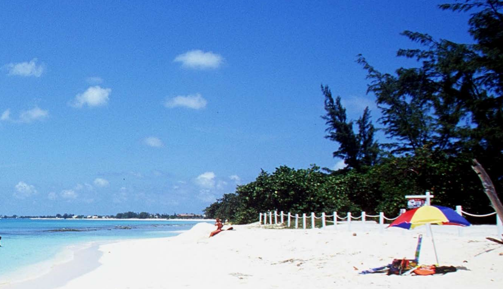
Main: Grand Cayman's glorious Seven Mile Beach was our first port of call. We also went diving at the USS Kittiwake (left), made some stingray pals (below inset) and visited the harbour capital George Town (facing page inset)